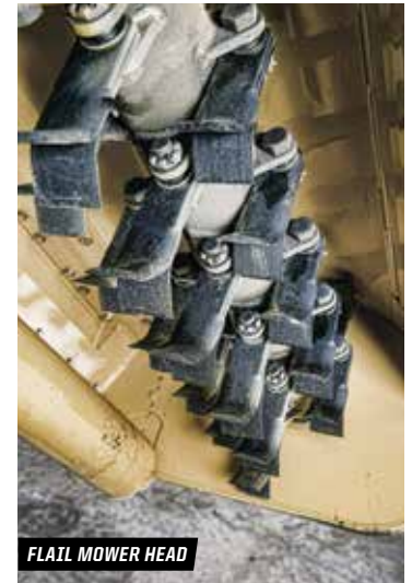
FLAIL MOWER HEAD