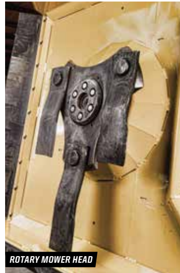
ROTARY MOWER HEAD